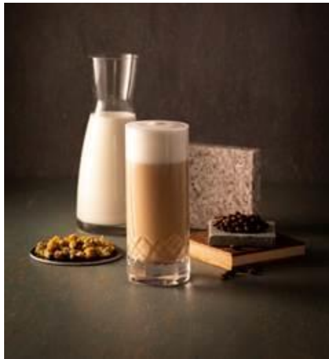
Origin + Bloom's chrysanthemum latte is exclusively available in April

Marina Bay Sands' signature dining gems SweetSpot and Origin + Bloom have launched a series of monthly beverage specials. Come March, the charming European-inspired patisserie Origin + Bloom will offer a limited-time mandarin peach tea (S$7), a thirst-quencher featuring jasmine tea with fragrant citrus mandarin and peach. In April, coffee connoisseurs can look forward to the Asian inspired chrysanthemum latte (S$7), a luscious cuppa infused with floral notes and capped with foamy crema.