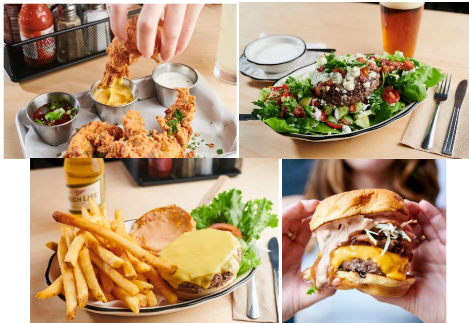
New tantalising dishes at Black Tap (clockwise from top left): buttermilk fried chicken tenders; wagyu wedge salad; The Carolina Burger; The Impossible Burger

Pair the shake with The Vegan Nashville Hot (S$21++) – a juicy whole breaded portobello mushroom served with Nashville hot sauce, coleslaw and pickles on a vegan bun. Savour the well-balanced flavours and textures of the Vegan Spinach Salad (S$21++), comprising baby spinach, quinoa, pomegranate, creamy avocado, crunchy apples, and spiced glazed pecans with a citrusy lemon miso vinaigrette. Diners can also enjoy the dish with a delicious slice of miso salmon (top up S$8++).