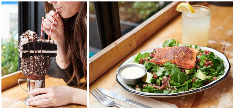
Diners can now select from an array of vegan options at Black Tap (L to R): Vegan Black 'N' White Cakeshake ; vegan spinach salad, topped with miso salmon