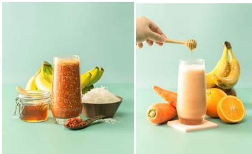
SweetSpot rolls out two delicious healthy smoothies (from L to R): goji berry smoothie (March), orange carrot smoothie (April)

For more information, please visit https://www.marinabaysands.com/restaurants/origin-and-bloom.html or call +65 6688 8588.