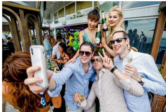
An epic bash awaits at the St Patrick's Day edition of LAVO Party Brunch

LAVO Italian Restaurant & Rooftop Bar's popular day-time LAVO Party Brunch series returns on Saturday, 7 March for an epic St Patrick's Day themed bash 57-storays above ground. Expect endless Perrier Jouet Champagne, Jameson whiskey, Guinness stout, house wines and beer, accompanied with a delicious Italian-American buffet spread. With live DJ sets and entertainment sets, this is a roof-top party not to be missed. Early bird and advance tickets for LAVO Party Brunch , priced from S$138++, are available for purchase online at www.marinabaysands.com . Standard tickets are priced at S$188++ at the door.