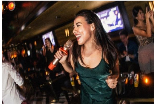
Party away with your favourite tunes and drinks at AVENUE

AVENUE has rolled out its new Mid-Week Karaoke package, exclusively available on Wednesday and Thursday nights. Belt out your favourite songs and enjoy craft cocktails and drinks served by a dedicated bartender at the intimate lounge, complete with a private bar. The 'Mid-Week Karaoke' packages come with a minimum spend of S$250++ on beverage purchases, per 2.5 hour booking. The space is also available for karaoke sessions on other nights at a different rate.